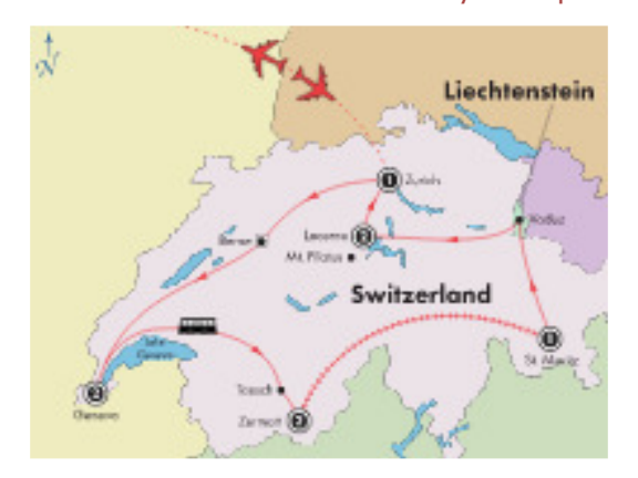
DAY 1, Thursday - Depart for Switzerland Depart for Switzerland

*Air & Land call for exact rates and dates from your departure point