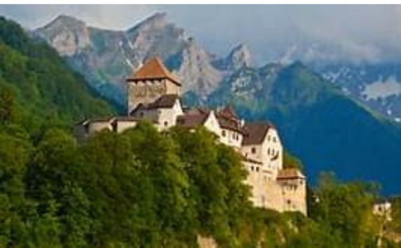
DAY 8, Thursday - Morning at Leisure in St. Moritz, Liechtenstein, Travel to Lucerne

Morning is at leisure to explore glitzy St Moritz on your own. Take a stroll on Via Serlas with its string of famous designer boutiques or, linger in one of the many sidewalk cafes and enjoy the spectacular alpine setting. Perhaps, join the optional Horse-Drawn Carriage Ride. Depart from Pontresina a resort town, located at the entrance to the Val Bernina just 4 miles from St Moritz for a ride through the Val Roseg. Marvel at the views of the impressive Bernina massif and the nearby glaciers. In the late morning, travel to Lucerne. En route stop in Liechtenstein, the tiny storybook Principality and the sixth-smallest country in the world that lies in the heart of the Alps, sandwiched between Switzerland and Austria. Its capital city Vaduz is a proud remnant of feudal Europe, still governed by one of the oldest noble families. Arrive in Lucerne, where the remainder of the day is at leisure to further explore this festive city on your own. Tonight, perhaps join the optional Swiss Folklore Dinner, which offers traditional customs of good food, homemade beer, music and fun