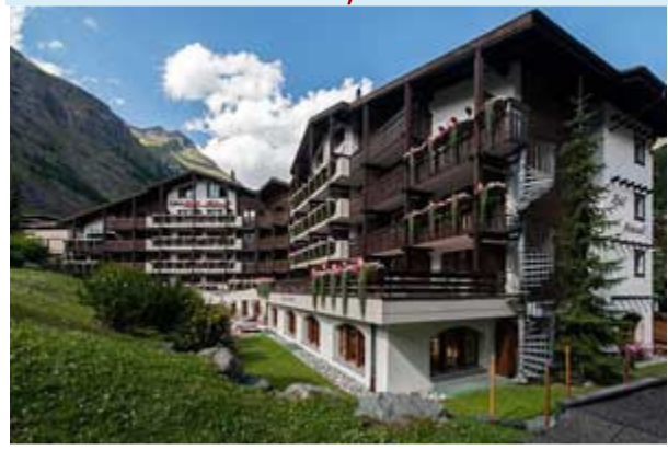
Hotel National Zermatt, Zermatt

This first class hotel is located in the center of Zermatt.